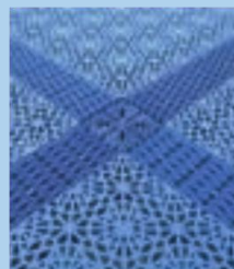
Expansion strips and Expansion Cross-piece