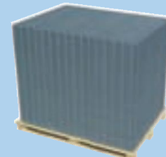
Pre-assembled sections 1,2 x 0,9 m