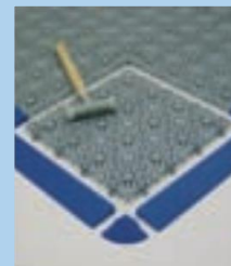
Edge strips and Corner strips